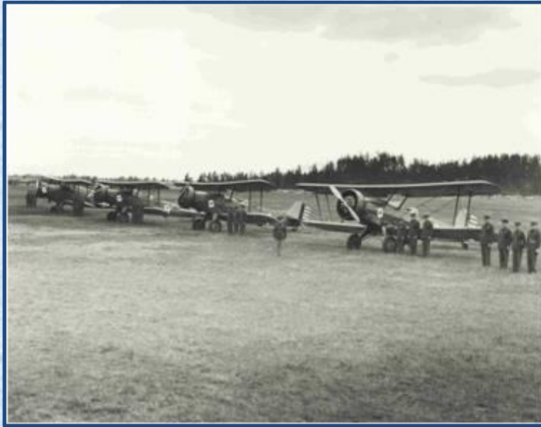
116th Observation Squadron O-38s at Gray Field, Washington

The 70th Intelligence, Surveillance, and Reconnaissance Wing's history began just prior to the United States entry into World War II. On 13 September 1941, the Army Air Forces established the 70th Observation Group (OG) at Gray Field, Washington. The new group initially used the assets of the existing 116th Observation Squadron (OS), a National Guard unit inducted into federal service a year earlier.