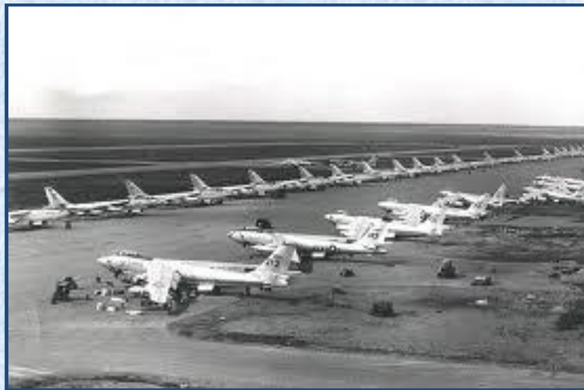
B-47s at Sidi Slimane AB, Morocco - 1956

In 1955, the Air Force activated the 70th Strategic Reconnaissance Wing (SRW) at Little Rock Air Force Base, Arkansas. As part of Strategic Air Command (SAC), the 70 SRW employed RB-47 and KC-97 aircraft to conduct strategic reconnaissance and air refueling. In October 1956, the 70 SRW deployed to Sidi Slimane Air Base, Morocco for training. While the 70 SRW was at Sidi Slimane, fighting between Egypt and Israel prompted Great Britain and France to land troops in Egypt to secure the Suez Canal. In response to the escalating situation, SAC ordered the 70 SRW to remain at Sidi Slimane. The conflict, known as the Suez Crisis, ended in November 1956 and the 70 SRW returned to Little Rock in December 1956.