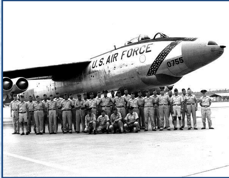
70th Strategic Reconnaissance Wing B-47 and Personnel Little Rock AFB, Arkansas, 1950's

In 1955, the Air Force activated the 70th Strategic Reconnaissance Wing (SRW) at Little Rock Air Force Base, Arkansas. As part of Strategic Air Command (SAC), the 70 SRW employed RB-47 and KC-97 aircraft to conduct strategic reconnaissance and air refueling. In October 1956, the 70 SRW deployed to Sidi Slimane Air Base, Morocco for training. While the 70 SRW was at Sidi Slimane, fighting between Egypt and Israel prompted Great Britain and France to land troops in Egypt to secure the Suez Canal. In response to the escalating situation, SAC ordered the 70 SRW to remain at Sidi Slimane. The conflict, known as the Suez Crisis, ended in November 1956 and the 70 SRW returned to Little Rock in December 1956.